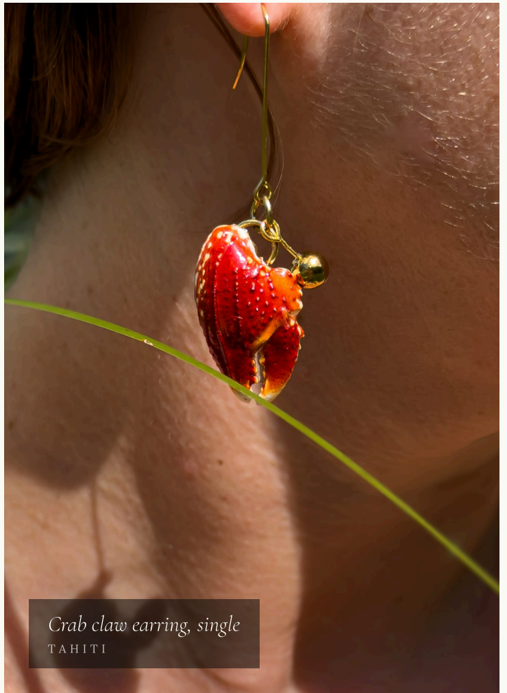
Crab claw earring, single TAHITI