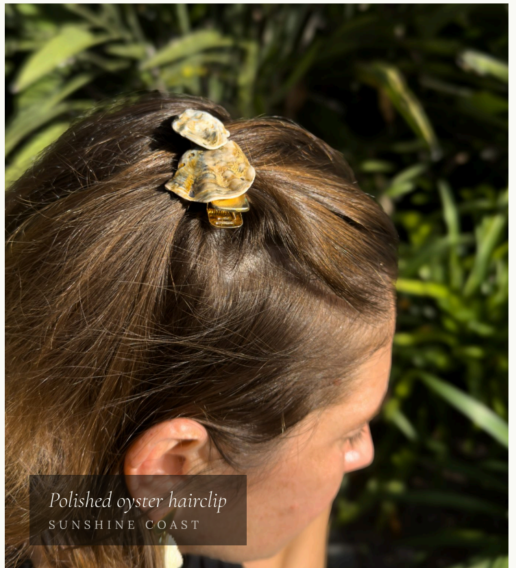
Polished oyster hairclip SUNSHINE COAST