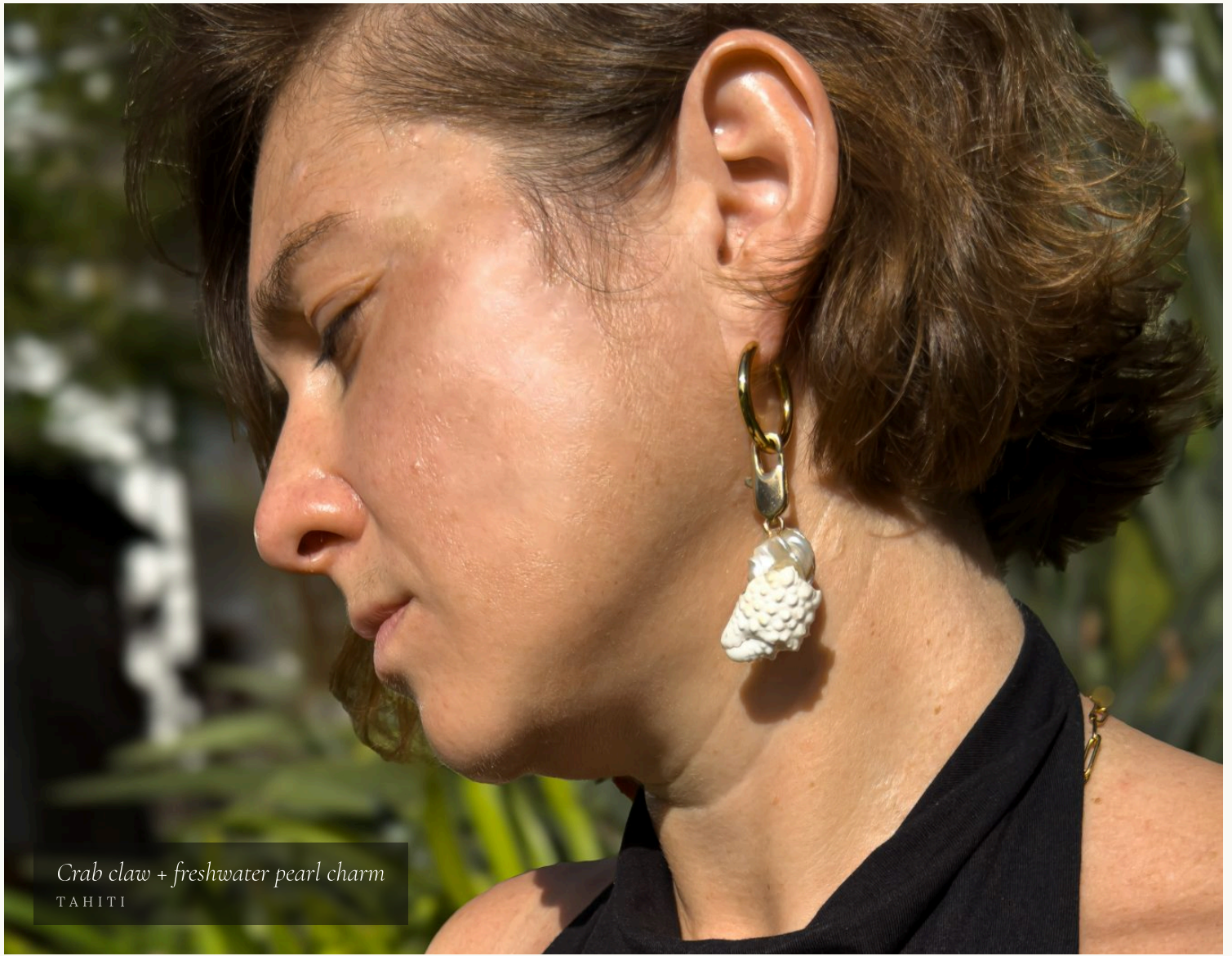
Crab claw + freshwater pearl charm TAHITI