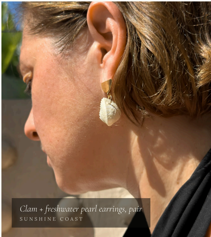
Clam + freshwater pearl earrings, pair SUNSHINE COAST